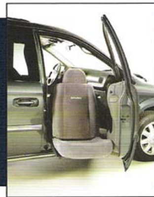
TURNING AUTOMOTIVE SEATING™ (TAS™)