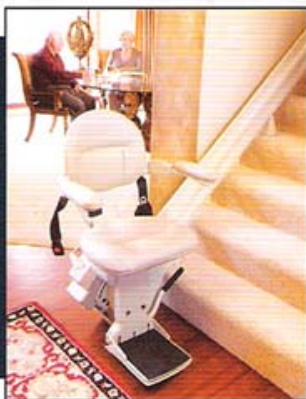
ELECTRA-RIDE™ ELITE Model SRE-2010

Home accessibility solutions and automotive products