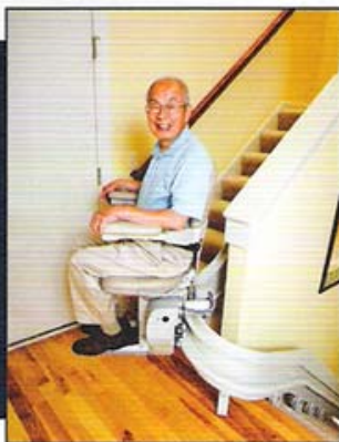
ELECTRA-RIDE™ III Model CRE-2110